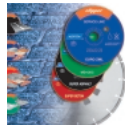
Complete and comprehensive range of diamond blades.