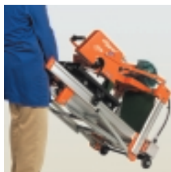
Ease of transportation.