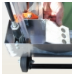
Slurry decanter in aluminium water tray.